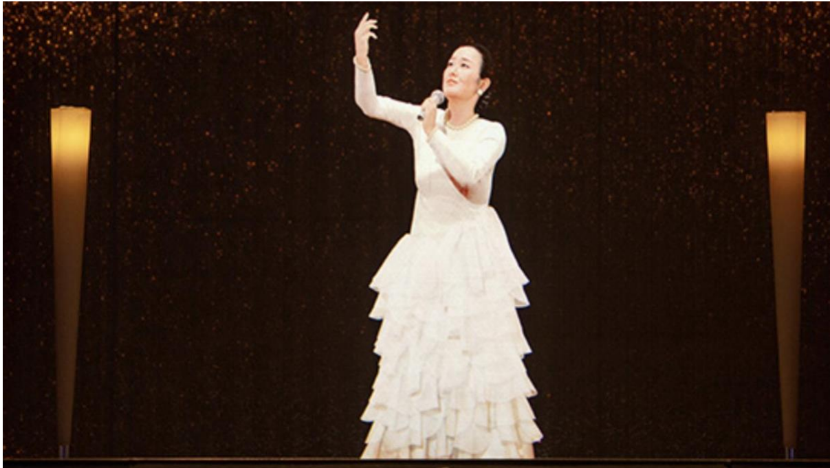
Figure 3. The hologram of Hibari Misora shown in the premiere performance of Arekara