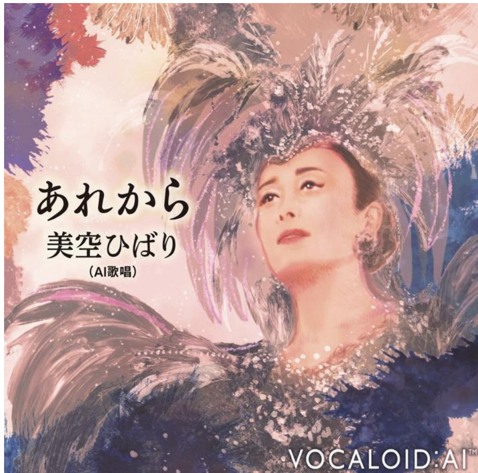
Figure 2. The single cover for Arekara