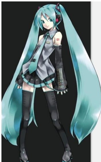
Figure 4. Hatsune Miku